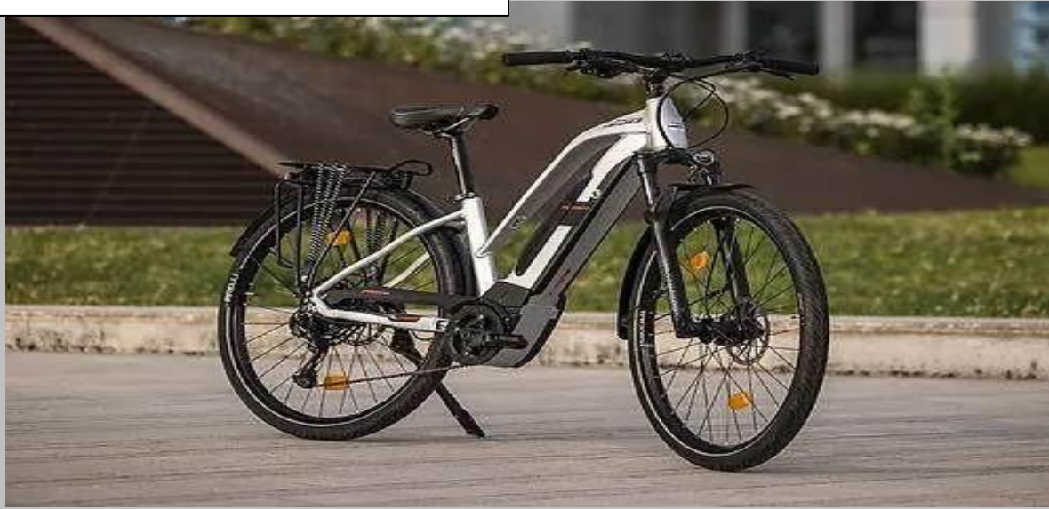
FANTIC - SEVEN DAYS LIVING EASY