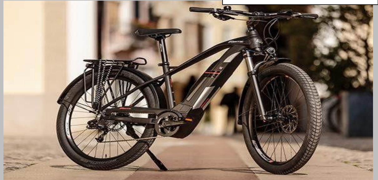
FANTIC - SEVEN DAYS LIVING